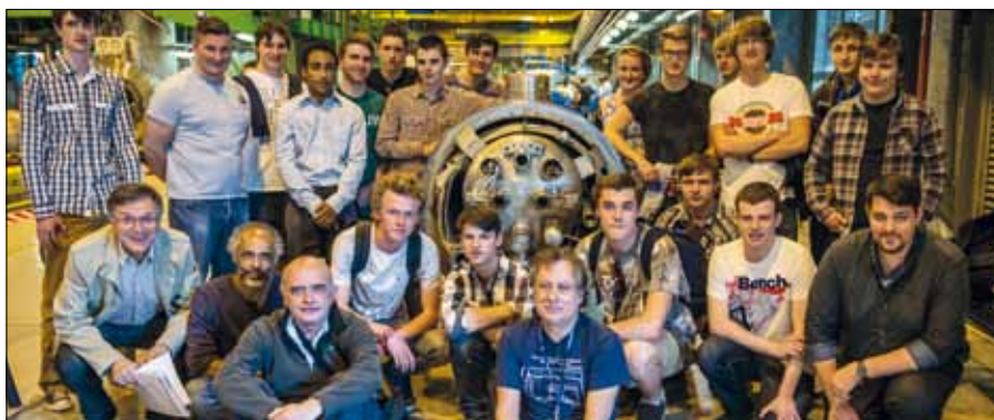
Students from Neston High School visited CERN in Switzerland for the 10th consecutive year.