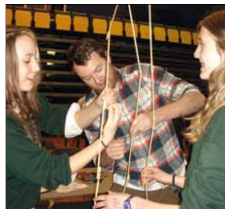
EDT's STEM Family Challenge Event at The Godolphin and Latymer School in London.

For more information: teachers who want to run a STEM Family Challenge Event for families in their school/college can contact the First Edition team (e-mail firstedition@etrust.org.uk or call 01707 871 504).