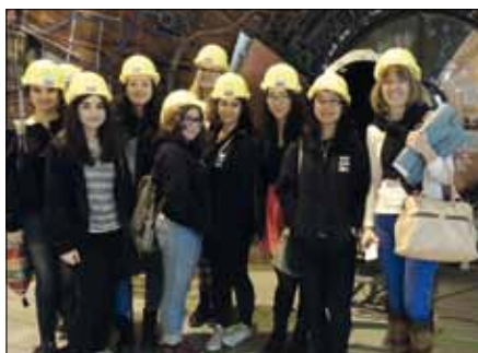
Withington Girls' visit to CERN in April 2014.

was lucky enough to be able to take a trip to CERN. When we arrived at the famous accelerator, we were given a lecture on the site's history, which took place in the very