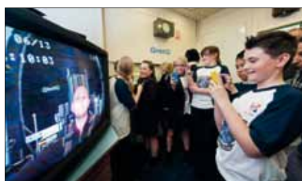
Students watching their teacher in the QinetiQ long-arm centrifuge.

Teachers involved (or who wish to get involved) with the Mission X Train Like An Astronaut programme will be given a unique opportunity to experience how astronauts train for launches and landings on 3 June. Following medical examinations by flight surgeons, they will be exposed to g-forces in the long-arm centrifuge operated by QinetiQ at Farnborough (made famous by