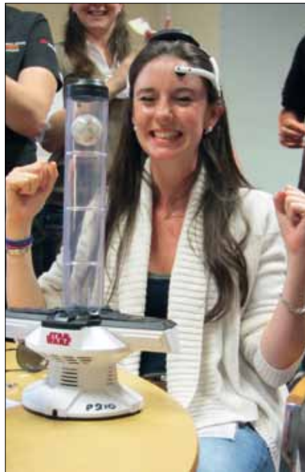
A teacher attending a "Fun is Physics" session at a Stimulating Physics Network Summer School (four-day residential CPD courses held at Oxford, Cambridge and York each year).

From a lower base, the number of pupils progressing to AS-level physics from SPN Partner Schools over the last two years has increased faster than in other eligible secondary schools; the impact among girls is particularly striking, with a 25% increase