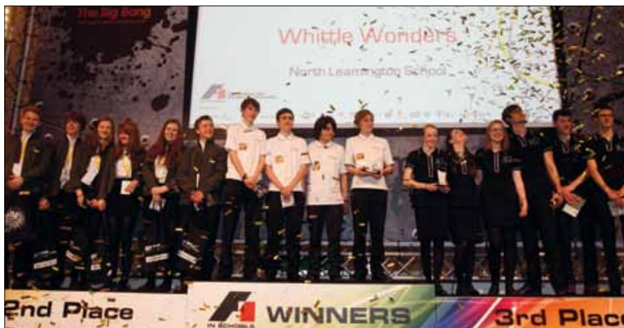
Leamington Spa students being crowned 2014 F1 in Schools UK National Champions.

from Robert May's School, Odiham, called Colossus F1 and the third-placed team was Infinity from St John Payne School, Chelmsford. The exceptional support given to the students by their teachers was also recognised with the Teacher of the Year