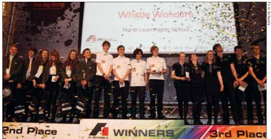
Leamington Spa students being crowned 2014 F1 in Schools UK National Champions.

from Robert May's School, Odiham, called Colossus F1 and the third-placed team was Infinity from St John Payne School, Chelmsford. The exceptional support given to the students by their teachers was also recognised with the Teacher of the Year