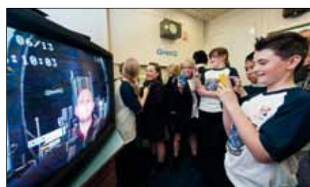
Students watching their teacher in the QinetiQ long-arm centrifuge.

Teachers involved (or who wish to get involved) with the Mission X Train Like An Astronaut programme will be given a unique opportunity to experience how astronauts train for launches and landings on 3 June. Following medical examinations by flight surgeons, they will be exposed to g-forces in the long-arm centrifuge operated by QinetiQ at Farnborough (made famous by