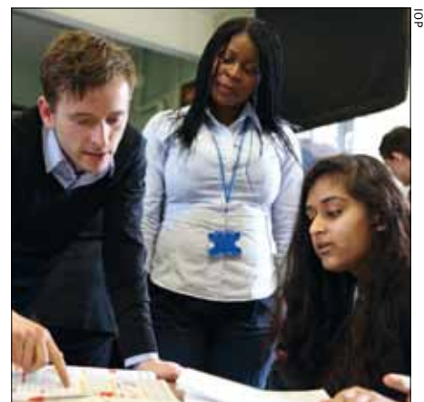
Can you offer a potential teacher a chance to kick-start their career in physics teaching?

We are currently looking for more schools to help out. There is no commitment at this stage; if you're happy to help we would simply add you to the database and let you know when we pass on your details. If at any time you are unable to commit to a visit, not to worry – we'll find another school for the